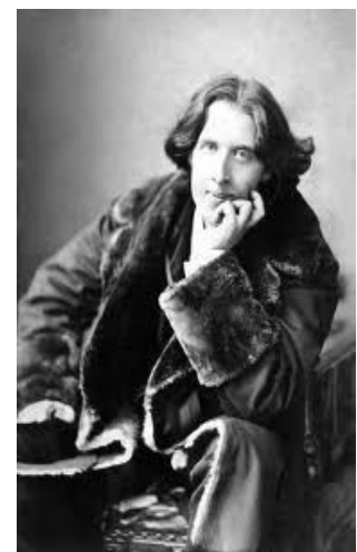
Oscar Wilde, Irish Playwright and Author of "The Importance of Being Earnest"